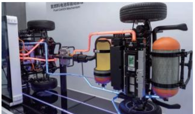
氢循环系统 Hydrogen circulation system