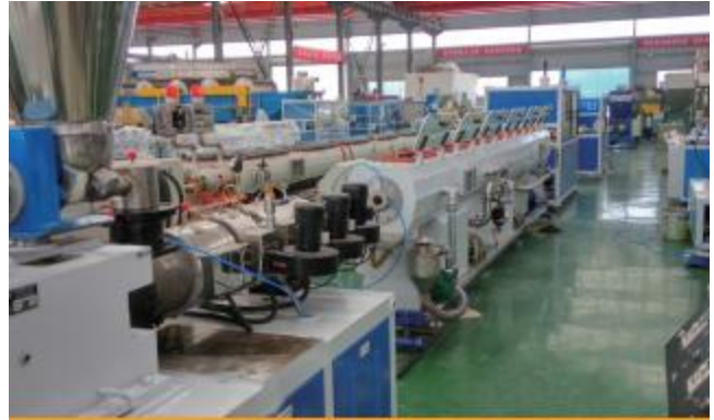
挤出机脱气 Extruder degassing