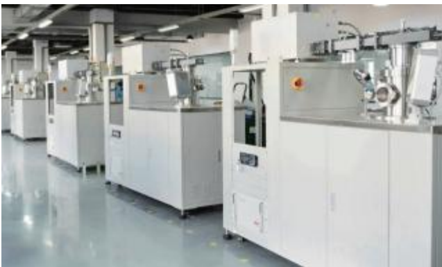
CVD钻石生长系统 CVD Diamond Growing System