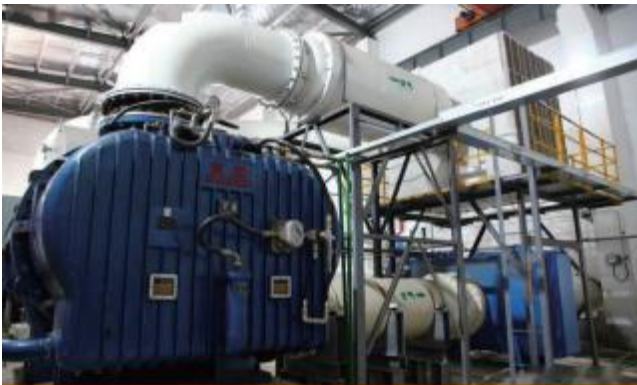
超大抽速变压吸附装置 Large suction pressure swing adsorption device